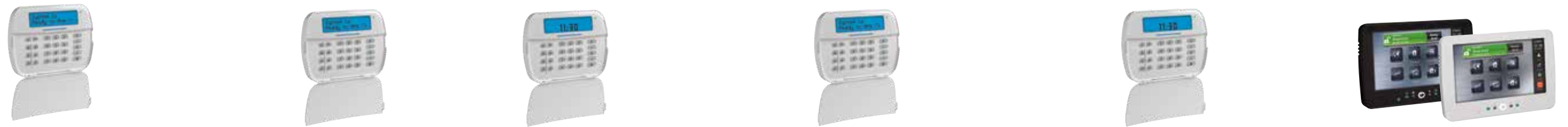
PowerG Wireless Full Message LCD 2-Way Wire-Free Keypad with optional Prox Support and Voice Prompting (HS2LCDWF9 / HS2LCDWFP9 / HS2LCDWFPV9) | Full Message LCD Keypad with optional Prox Tag Support (HS2LCD / HS2LCDP) | ICON Hardwired Keypad with optional Prox Tag Support (HS2ICN / HS2ICNP) | PowerG Full Message LCD Keypad with Built-in Transceiver with optional Prox Support (HS2LCDRF9 / HS2LCDRFP9) | PowerG ICON Hardwired Keypad with Built-in Transceiver with optional Prox Support (HS2ICNRF9 / HS2ICNRF9P) | Hardwired Touchscreen Keypad 7 inch with Prox Support in Black or White (HS2TCHP / HS2TCHPBLK)