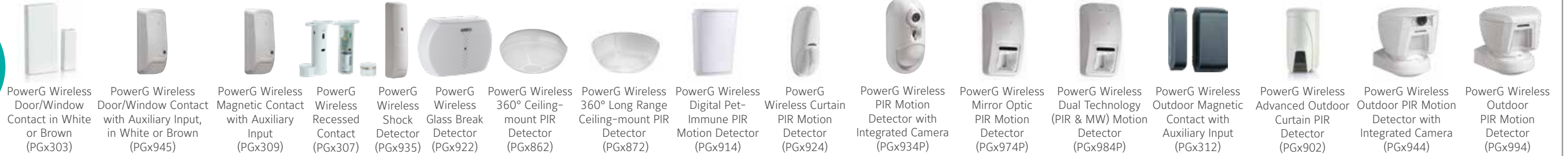
PowerG Wireless Door/Window Contact in White or Brown (PGx303) | PowerG Wireless Door/Window Contact with Auxiliary Input, in White or Brown (PGx945) | PowerG Wireless Magnetic Contact with Auxiliary Input (PGx309) | PowerG Wireless Recessed Contact (PGx307) | PowerG Wireless Shock Detector (PGx935) | PowerG Wireless Glass Break Detector (PGx922) | PowerG Wireless 360° Ceiling-mount PIR Detector (PGx862) | PowerG Wireless 360° Long Range Ceiling-mount PIR Detector (PGx872) | PowerG Wireless Digital Pet-Immune PIR Motion Detector (PGx914) | PowerG Wireless Curtain PIR Motion Detector (PGx924) | PowerG Wireless PIR Motion Detector with Integrated Camera (PGx934P) | PowerG Wireless Mirror Optic PIR Motion Detector (PGx974P) | PowerG Wireless Dual Technology (PIR & MW) Motion Detector (PGx984P) | PowerG Wireless Outdoor Magnetic Contact with Auxiliary Input (PGx312) | PowerG Wireless Advanced Outdoor Curtain PIR Detector (PGx902) | PowerG Wireless Outdoor PIR Motion Detector with Integrated Camera (PGx944) | PowerG Wireless Outdoor PIR Motion Detector (PGx994)