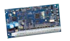
6 to 128 zone control panel (HS2016 / HS2032 / HS2064E / HS2128E)