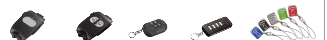
PowerG Wireless Panic Key (PG9938) | PowerG Wireless 2-Button Key (PG9949) | PowerG Wireless 4-Button Key (PG9939) | PowerG Wireless 4-Button Key (PG9929) | Mini Prox Tag MPT