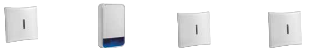
PowerG Wireless Indoor Siren (PG9901 BATT) | PowerG Wireless Outdoor Siren (PG9911 BATT) | PowerG Wireless Repeater (PG9920) | PowerG Host Transceiver Module (HSM2HOST9)