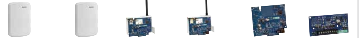
Dual Path LTE/Internet Alarm Communicator compatible with ALARM.COM (TL880LEAT/TL880LETL) | Dual Path LTE/Internet Alarm Communicator compatible with ALARM.COM (TL880LTVZ) | LTE Cellular Alarm Communicator (optional serial connection for integration) (LE2080(R)) | Internet and LTE Dual-path Alarm Communicator (optional serial connection for integration) (TL280LE(R)) | Internet Alarm Communicator (optional serial connection for integration) (TL280(R)E) | Communicator Remote Mounting Module (PCL-422)