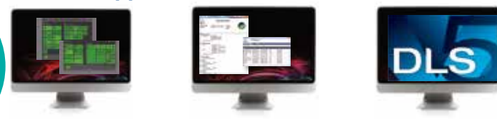
WebSA System Administrator Software | Routine System Management Software (RSM) | DLS 5 Downloading Software