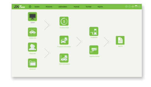
license plate recognition LPR